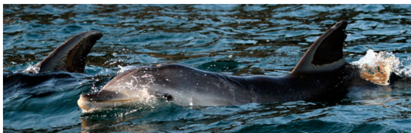
Figure 3 Surfacing behaviour of individual TM007 alongside presumed mother TM009 on 19 September 2012.

TM007 was last photographed on 11 October 2012 (Table 1); however, a sighting without photographic evidence was reported on 21 October